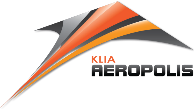
Artist's Impression of KLIA Aeropolis Airport Central