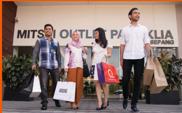
Mitsui Outlet Park KLIA Sepang

KLIA Aeropolis. Well-conceived for work-play living.