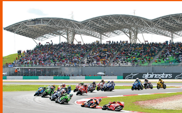
Sepang International Circuit